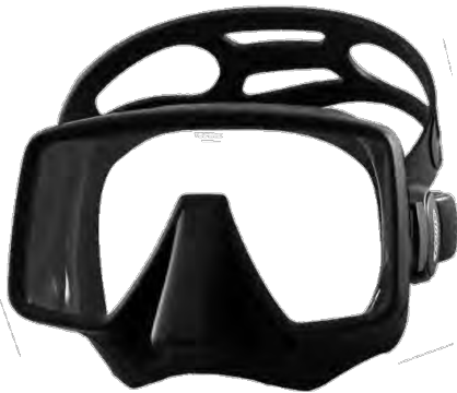
Insight Frameless M230