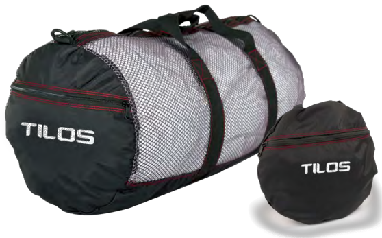
Kadabra Duffel 94017

These compactable bags fold down into their own pockets making them a great companion for travel and on limited space dive boats. The backpack boasts features found on non-compactable bags such as a side zipper, side carry handle, heavy duty padded backpack straps, and 400 denier nylon.