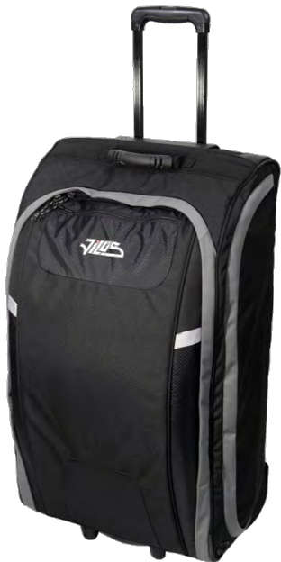
Transcend Wheeled Luggage 96148