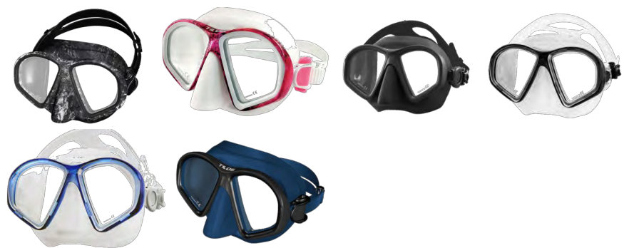
Spawn M130 M130-2 Black Camo, Green Camo, Pink/White Silicone