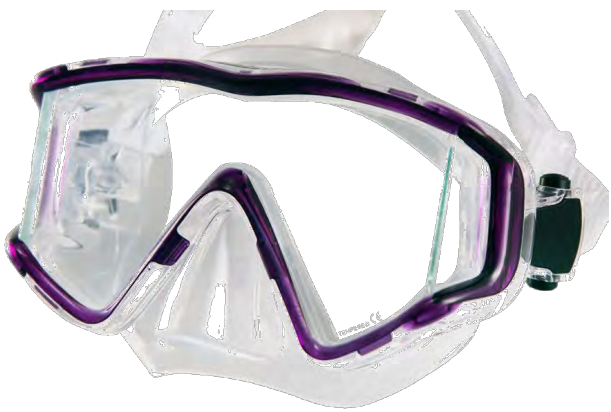
Panoramic (2nd Generation) M170 M180 Purge