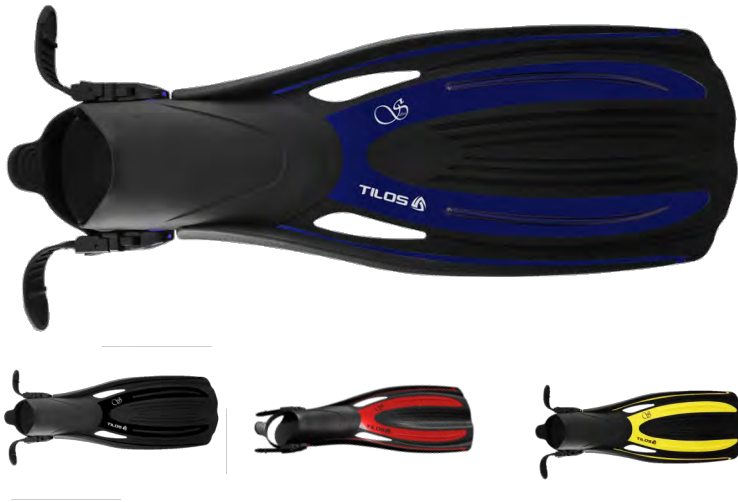
Saber Open Heel Fin