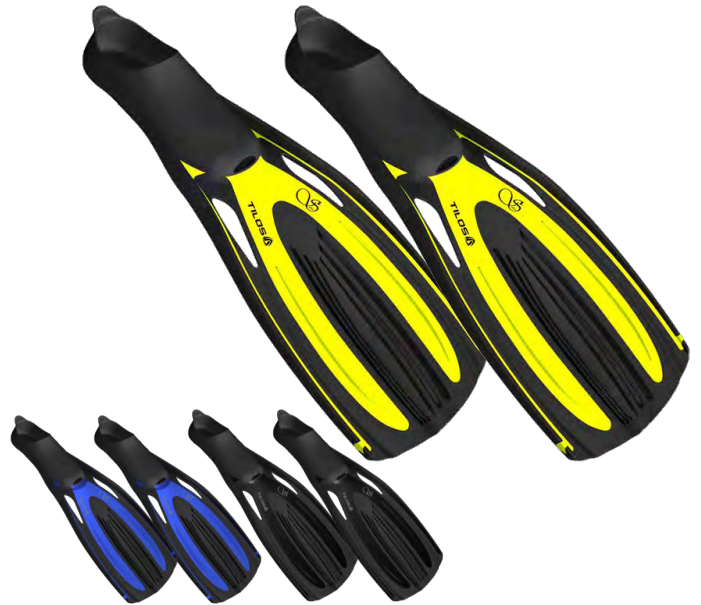
Saber Full Foot Fin