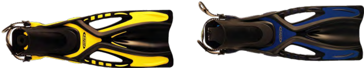
Glide Open Heel Fin F7855 Size: S/M, L/XL F7955 Glide Jr Size: S/M, L/XL