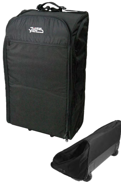
Total Eclipse 96149