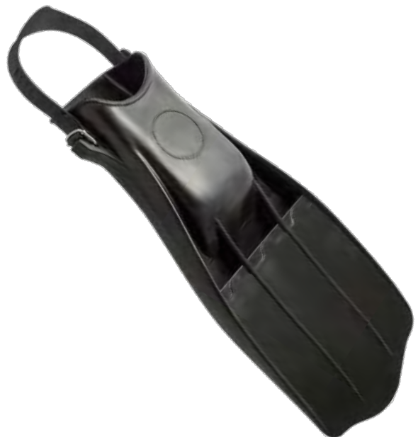
Classic Rubber Dive Fin F8100 Size: M/L, XL, 2XL