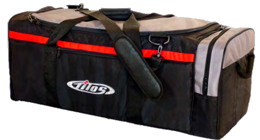
Marina Duffel 94164