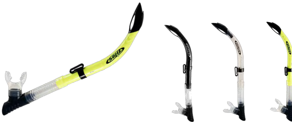
High Flow Semi-Dry S960