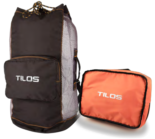
Kadabra Backpack 97217