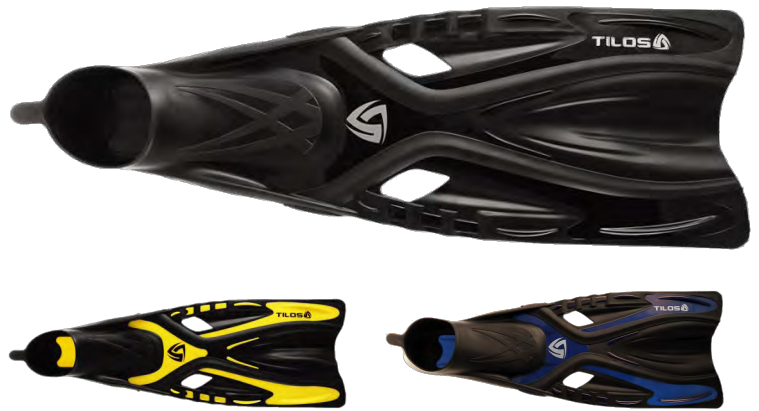
Voyage Full Foot Fin