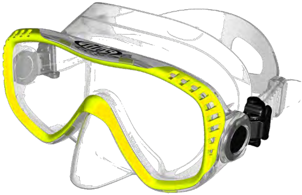
Visionary II M380