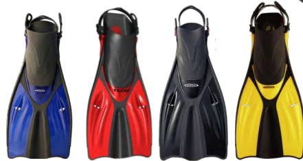
Getaway Open Heel Fin F6200 Size: S/M, ML/XL