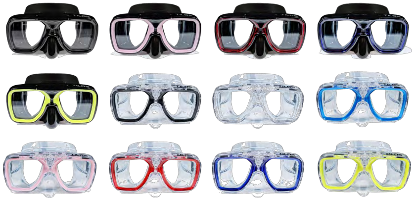
Universal + M810 Corrective lenses available