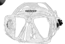
Flex Folding Mask M960