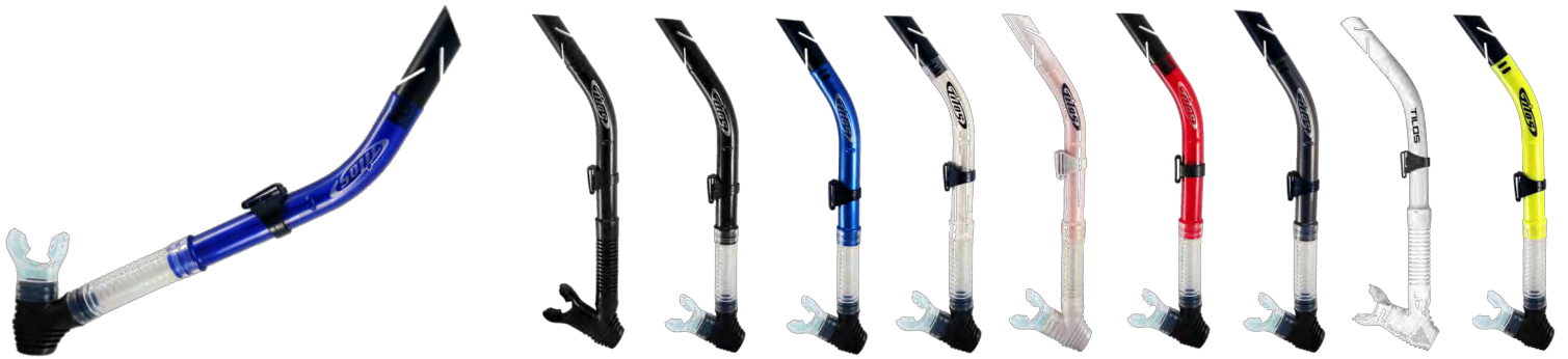
Splash Semi-Dry S1000