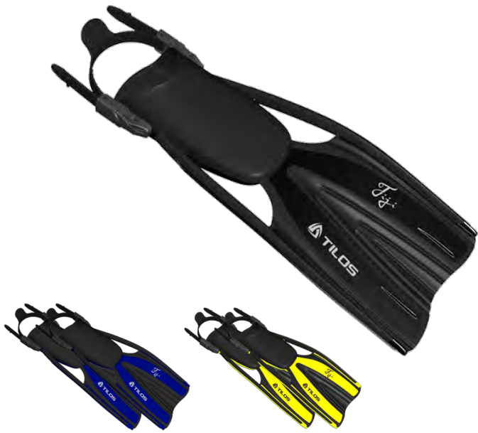
Fiji Open Heel Fin F7013 Size: XS/S, M, L/XL