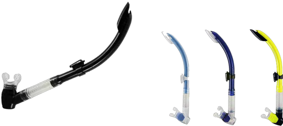
Xeno Semi-Dry S137