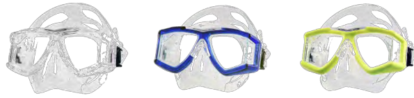
Panoramic 2 Lens