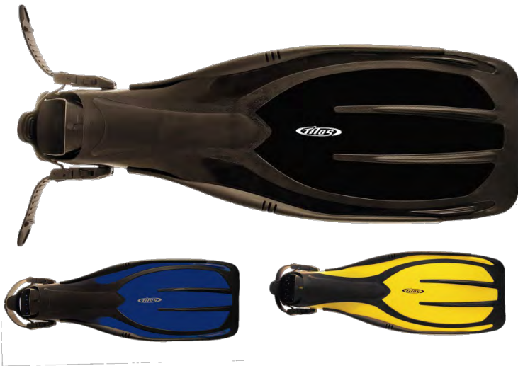
Torrent Open Heel Fin